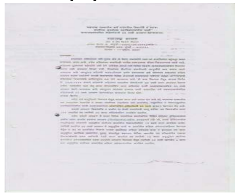
GR Regarding Reservation Not More Than 52%