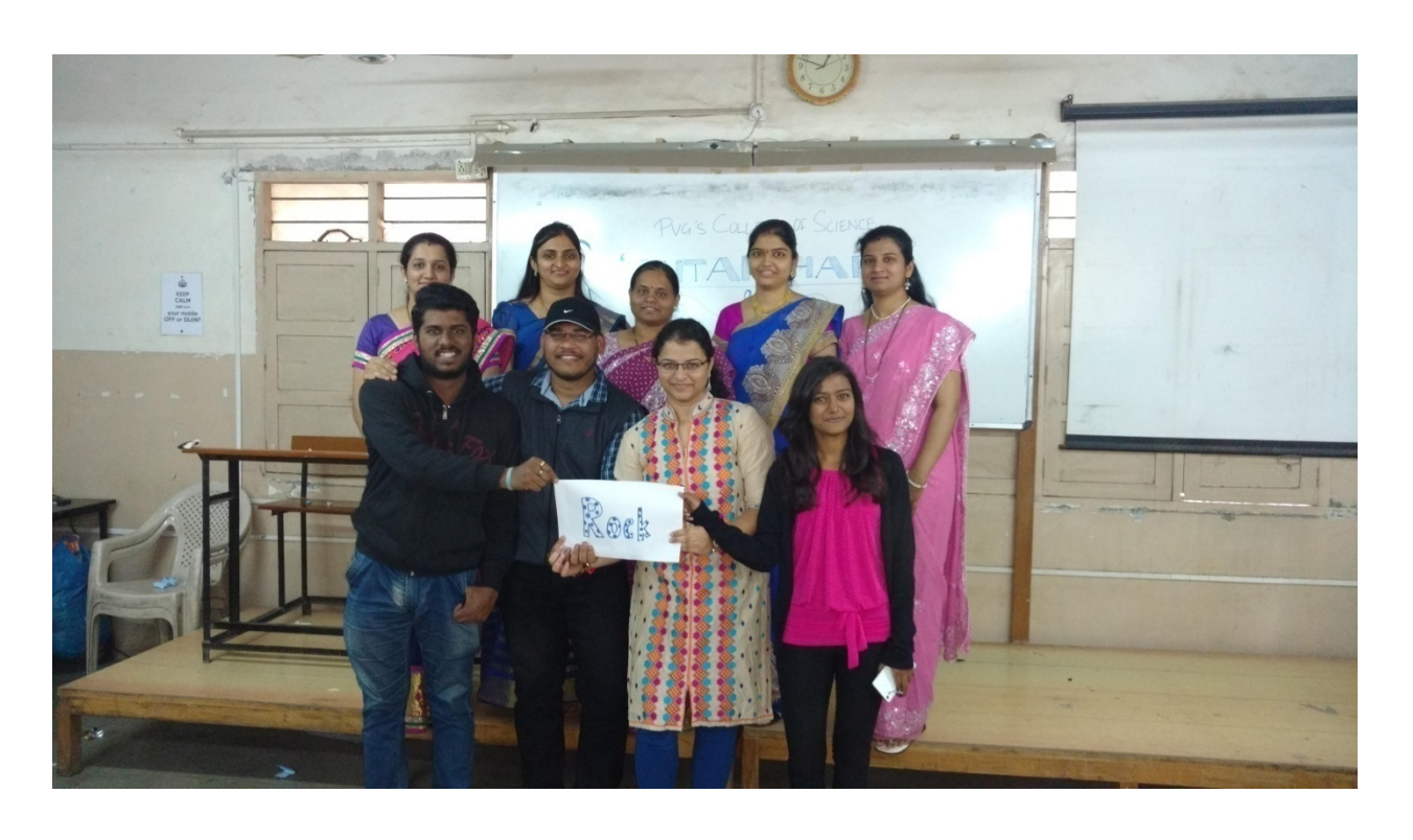
Antakshari Organizing Committee and Winning Team