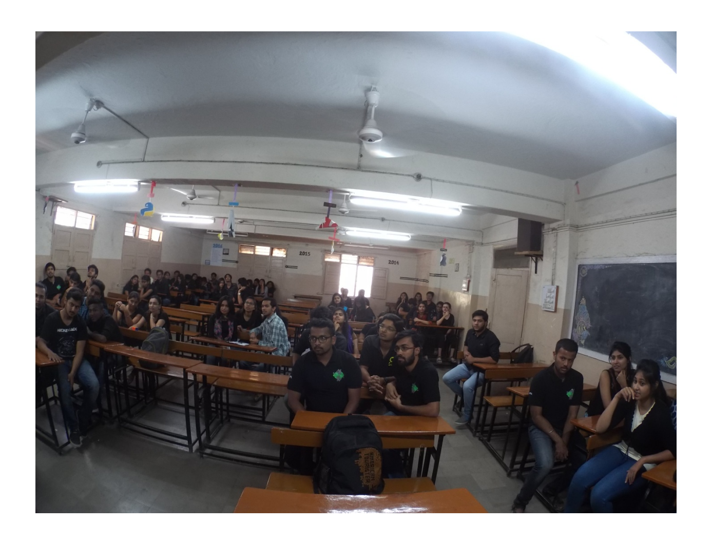
Treasure Hunt Teams