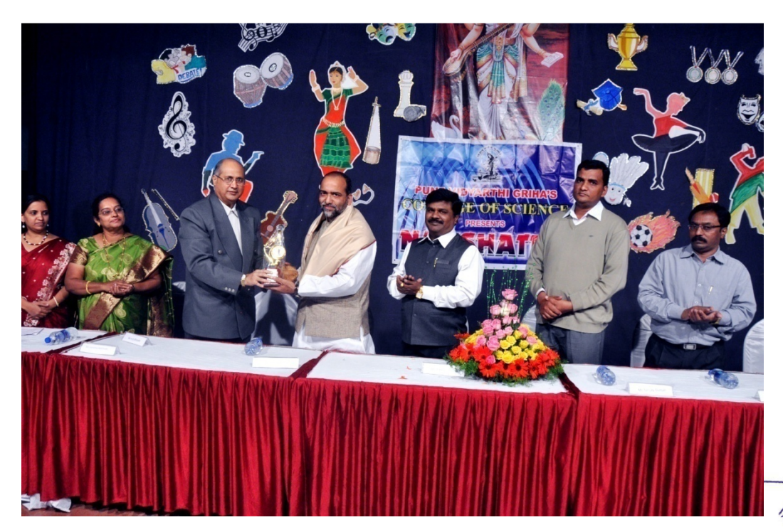
Felicitation of Chief Guest