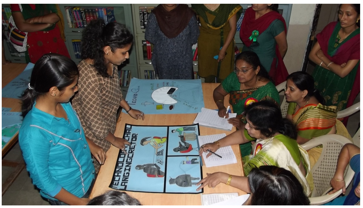
Judges of Poster Competition