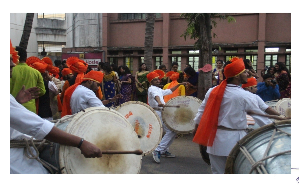
Traditional Day Miravnuk