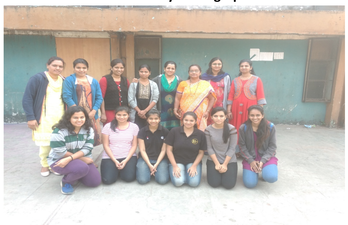
Foot-Cricket Event Organizing Team – 2017-18