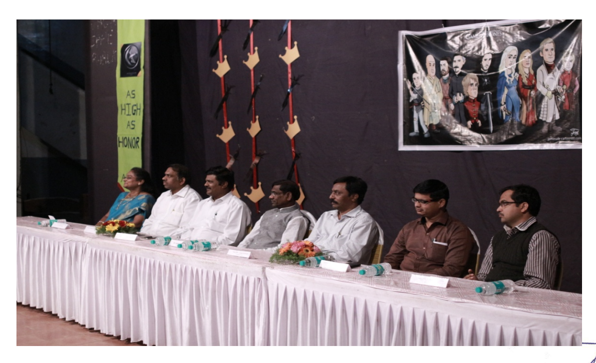
Guest of Honors on the Dias