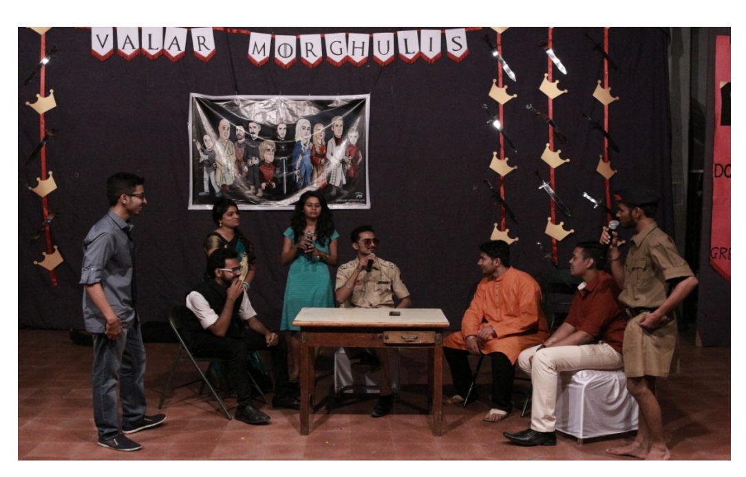
Drama Presented by UG Students