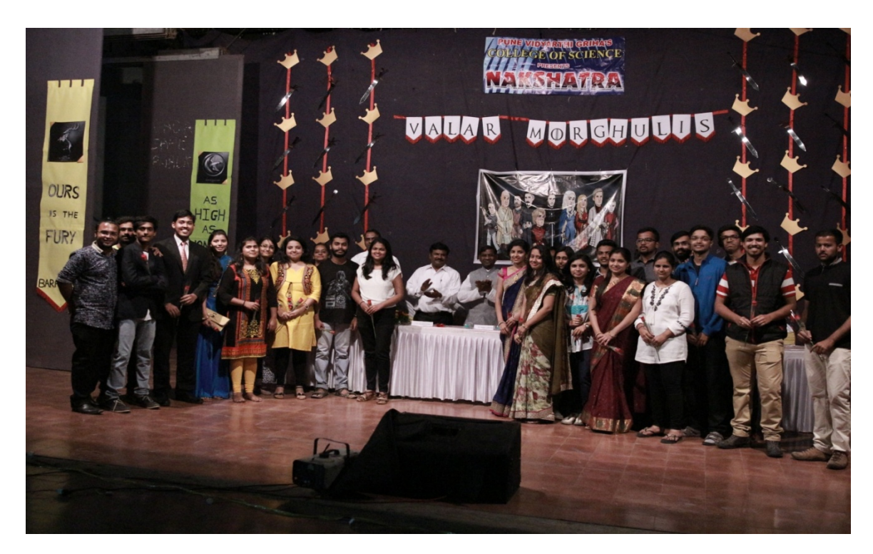
All Class Representatives