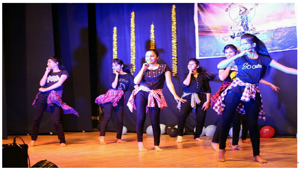
Dance Performance of S.Y.B.Sc. Girls