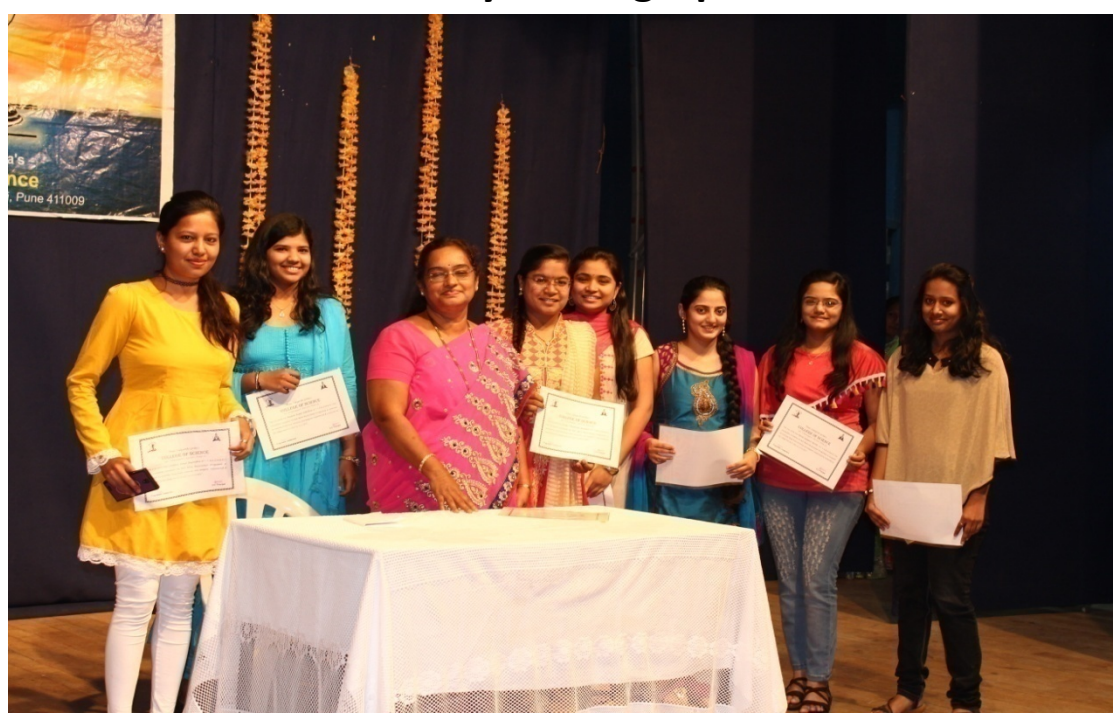
Toppers of Academic Year 2016-17