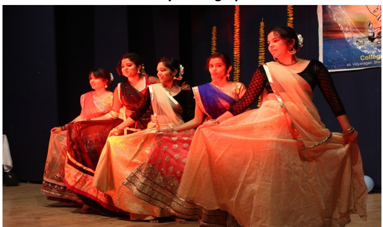
Dance Performance by T.Y.B.Sc. Girls