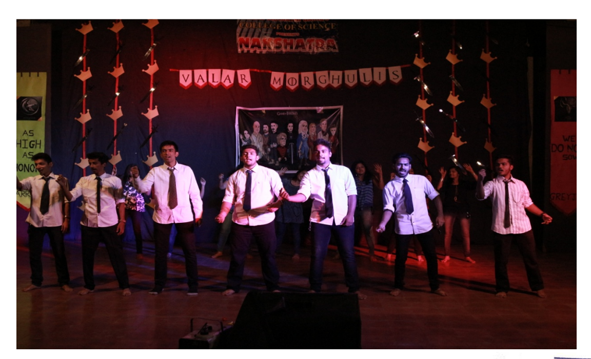
Dance Performance by Boys