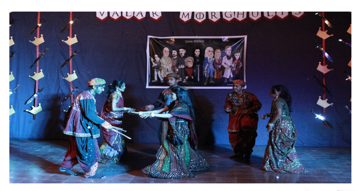
Dance Performance by S.Y. B.Sc. Students